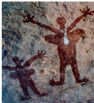
Pictographs, Queensland and Northern Territory, Australia